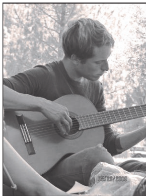
photos from the first annual BDANC apprentice camping trip to Cache Creek