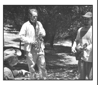
Making yarrow prep and making music at our summer meeting