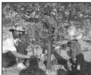
Painting tree paste on almond trees at Marion Farms during the Spring 2010 meeting