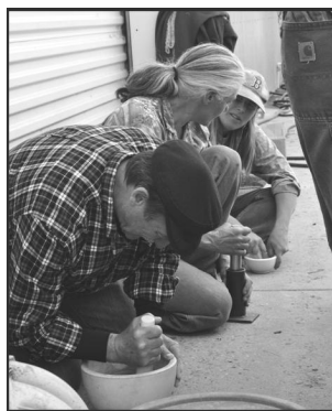
Making horn orthoclase at the Spring 2010 meeting

This year, our Spring Meeting honors two important anniversaries: BDANC at 25, and Rudolf Steiner at 150. We invite you to join us in celebration and gratitude for Biodynamics and the gifts that came out of Anthroposophy (the philosophy of Rudolf Steiner) in agriculture, education, medicine, movement arts, and community life.